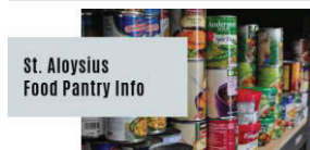
St. Aloysius Food Pantry Info

Thurs Dec 18 7pm, Blessed Sacrament, Kitchener